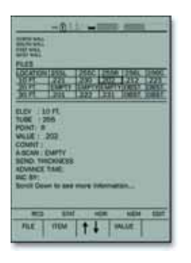
Quick and easy navigation within a file

For your alphanumerical data inputs we have created the "Virtual Keyboard" which is displayed on the DMS 2 screen and makes it easy for you to input data.