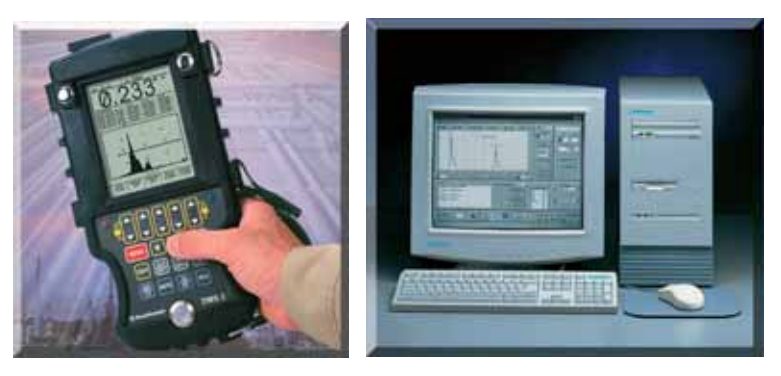
The DMS 2 data mangement system with application software for data transfer and management as well as for documentation